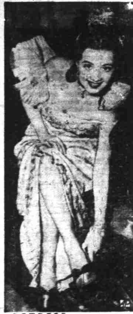
ACTRESS—Olga San Juan sits out scene on Hollywood studio lot to do slight repair job on heel of her shoe.

Many sufferers relieve nagging backache quickly, once they discover that the real cause of their trouble may be tired kidneys. The kidneys are Nature's chief way of taking the excess acids and waste out of the blood. They help most people pass about 3 pints a day. When disorder of kidney function permits poisonous matter to remain in your blood, it may cause nagging backache, rheumatic pains, leg pains, loss of pep and energy, getting up nights, swelling, puffiness under the eyes, headaches and dizziness. Frequent or scanty passages with stinging and burning sensations show there is something wrong with your kidneys or bladder. Don't wait! Ask your druggist for Doan's Pills, a stimulant diuretic, used successfully by millions for over 50 years. Doan's give happy relief and will help the 15 miles of kidney tubes flush out poisonous waste from your blood. Get Doan's Pills.