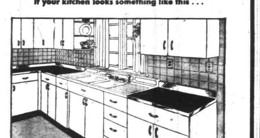
Change it to a modern, attractive work-saving room with Youngstown units