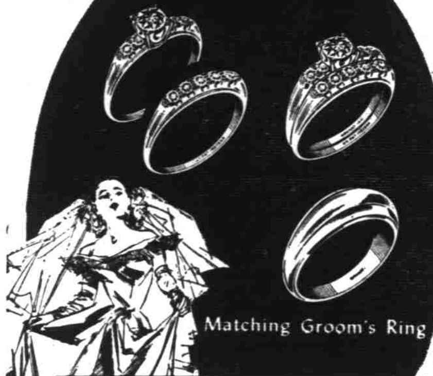
Matching Groom's Ring