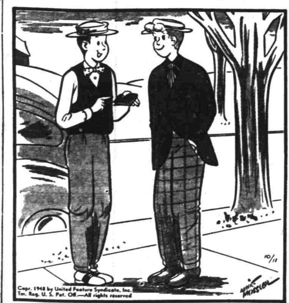
Our worries are over, chum ... My brother just got married and be queathed me his book of phone numbers!"