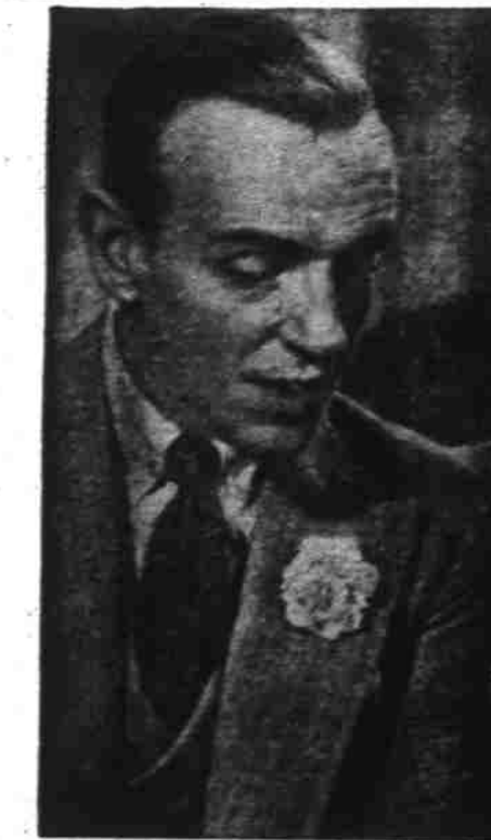
Judy Garland and Fred Astaire appear together for the first time in Irving Berlin's "Easter Parade." M-G-M Technicolor hit, which opens Saturday at the Elmore Theatre. Peter Lawford and Ann Miller are in the cast.

TO PLACE YOUR CLASSIFIED ADS PH. 2-2441 The Oregon Statesman