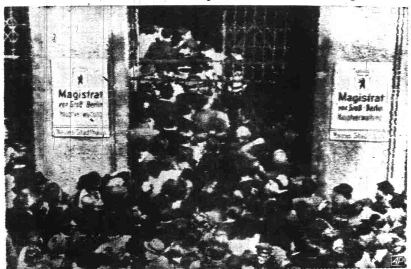
BERLIN, Sept. 7—Communist-led demonstrators smash their way into Berlin's city hall (Sept. 6) during demonstration to keep the Berlin City Council from meeting. Soviet-controlled police made no attempt to halt the demonstration, the third of its kind in 10 days.