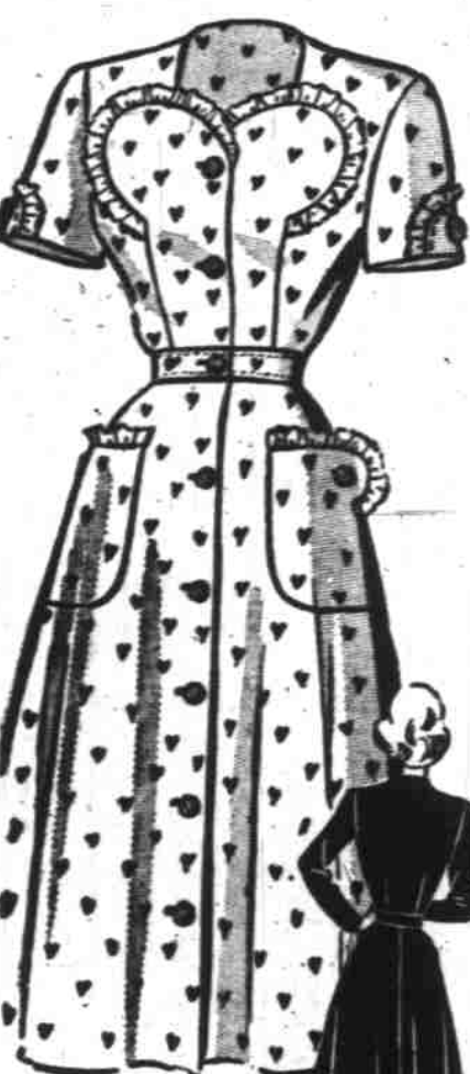
4670 SIZES 12-20, 40

Happy days for homemakers! Wear this gay ruffled scalloped dress, with compliments at breakfast. Pattern 4670 is a frock to rejoice over, with easy-sew design.