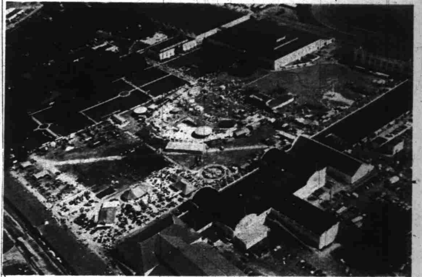
Where Oregon residents will stage—and enjoy—their own annual statewide celebration is shown by this aerial photo. The fairgrounds in northwest Salem appear much as they will Monday morning when the 83rd annual state fair opens for a full week.