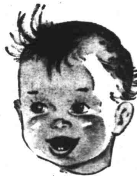
I'm Bonny The Ironer