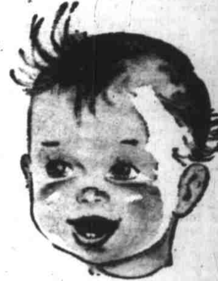
I'm Bunny The Dryer

OUR MOTTO: "We take the 'irk' out of work on washday"