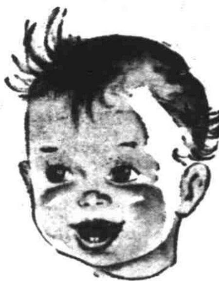
I'm Benny The Washer

We're 3 little B's ★ And We Love to Please, We Do Your Work For You With the Greatest of Ease