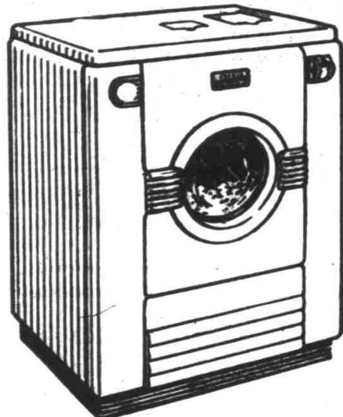
Only $54.00 Dn., Model B210

Come In and See Us at Ralph Johnson Appliances