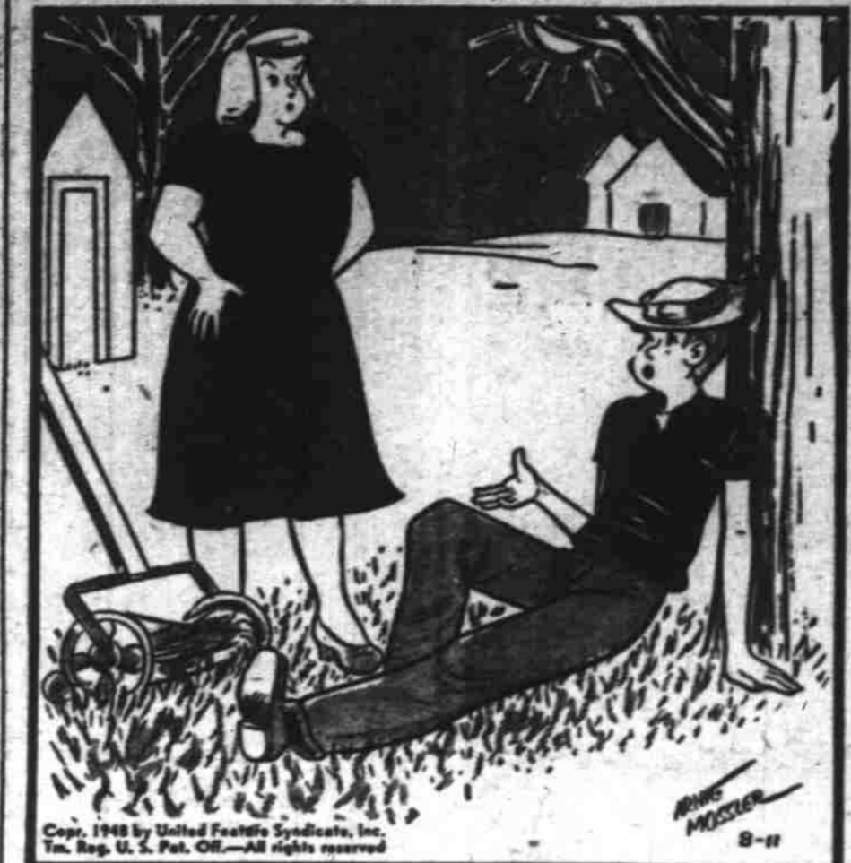
"I got so tired thinking about it that I just have to take a little nap before I start, Mom!"