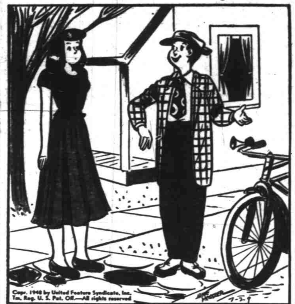
"I didn't say anything about a car... I said we'd go for a RIDE!"

Portland Produce... Portland, Ore., July 28 (AP)—(USDA) —Salable and total cattle 150, calves 25; market slow, generally steady; package low medium 197 lb. grass steers 27.00; top medium grass heifers 26.00; common kinds 22.00-25.00; bulk medium 20.00-22.00; cutter-common 17.00-19.00; canners; mostly 15.00-16.50; few 14.75; best dairy type cows 17.00-19.00; good sausage beef 25.50-26.00; good sausage bulls 25.00-26.00; vealers steady; bulk good-choice 25.00-26.00; medium 24.00-25.00; common 19.00-22.50.