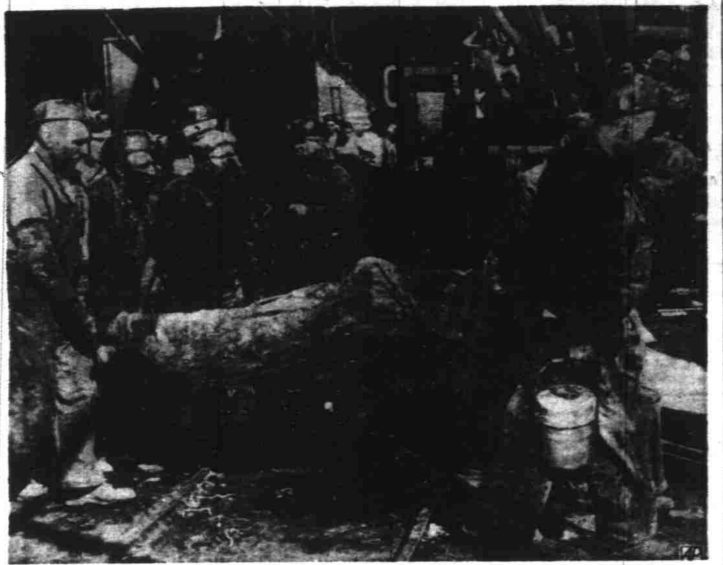
PRINCETON, Ind., July 28 — Rescue workers remove body of one of the 13 miners killed in the Princeton, Ind., mine explosion in the King's mine. In addition to those killed, four others were injured in the blast.