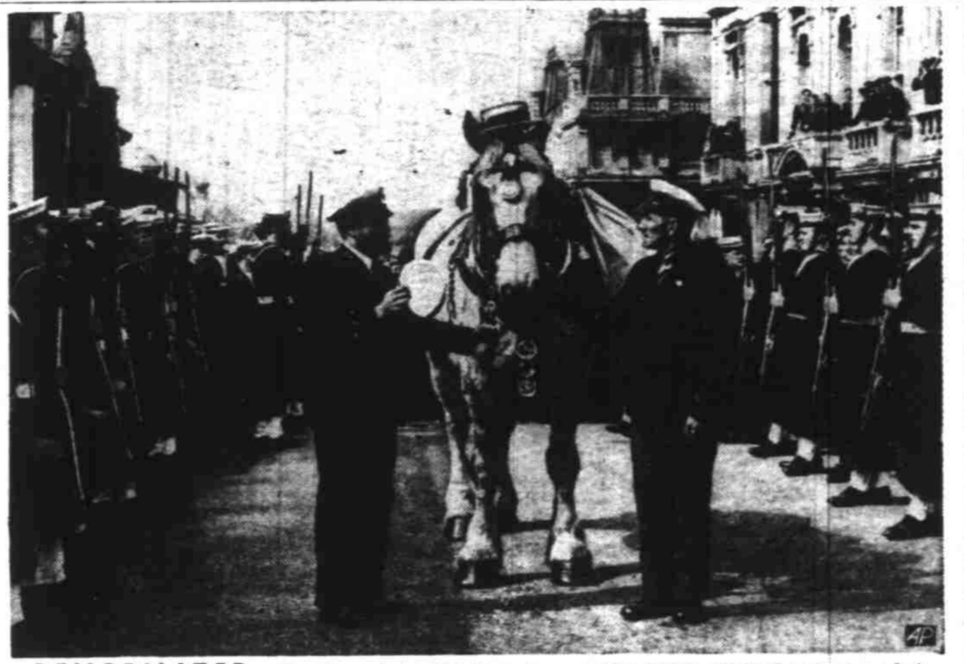
DEMOLISHED — Royalty, only British horse at Devonport, England, gets straw hat to replace his uniform cap as marines stand at attention. After 5 years in Navy, Royalty was sold for farm work. An engine will do his job of pulling a cricket-ground roller.