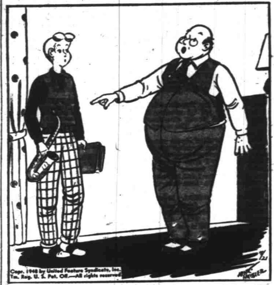
"Okay, you can sell it if you want, but not to anyone living within a half mile radius of this house, understand?"