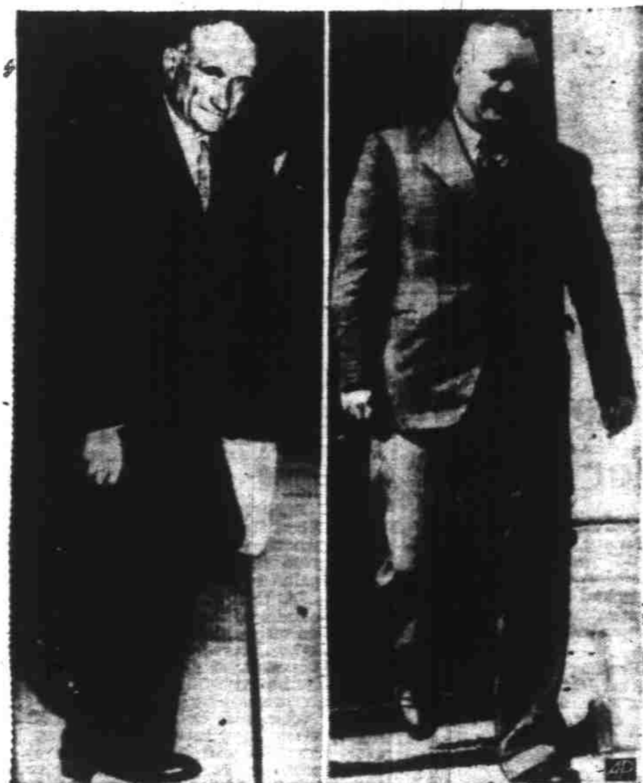
PARIS, July 20 — France's Premier Robert Schuman (left), hat in hand, enters Elysee Palace for conference with President Vincent Auriol after the collapse of Schuman's coalition government. And at right Maurice Thorez, French communist leader, leaves the presidential palace after calling on President Auriol who is seeking a new premier. Thorez communists proposed that Thorez be designated premier to head a coalition government of socialists and communists.