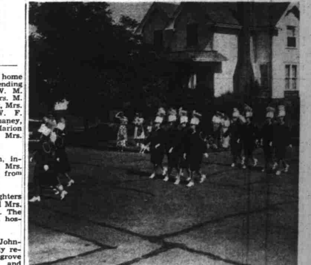
Among fraternal drill teams marching in parade and competing in night show Friday was this 15-member Eagles ladies drill team of Sheridan, captained by Lois Tatom. The precision marchers were garbed in brown and gold, with white hats and gold plumes.