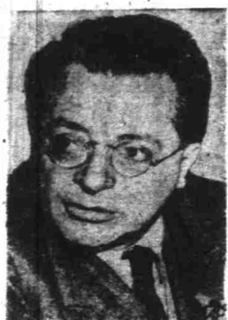
ROME, July 15 — Three bullets fired by a Sicilian law student struck Italian communist leader, Palmiro Togliatti, yesterday and set off a series of riots throughout Italy.