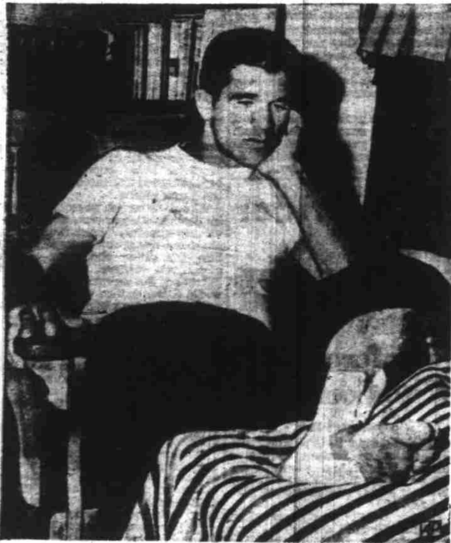
BOSTON, July 7—Gil Dodds, ace distance runner, glumly looks at his taped-up ankle and leg at Boston after he strained his Achilles tendon. It is possible he may not be able to compete in final Olympic tryouts in Chicago July 10. Dodds has been unbeaten in his last 37 competitions.

Employees of French wineries are provided with a bottle of wine a day at the winery and a cask every two months for home use.