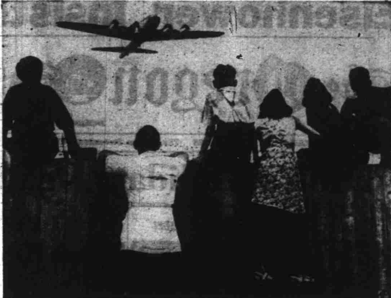
BERLIN, July 5 — Berlin children have a new pastime these days as they gather on the fences around Tempelhof airport watching the fleets of American planes arrive with supplies for the city, now on short rations because of the land and water blockade established by the Russians. An American four-engine transport flies overhead.