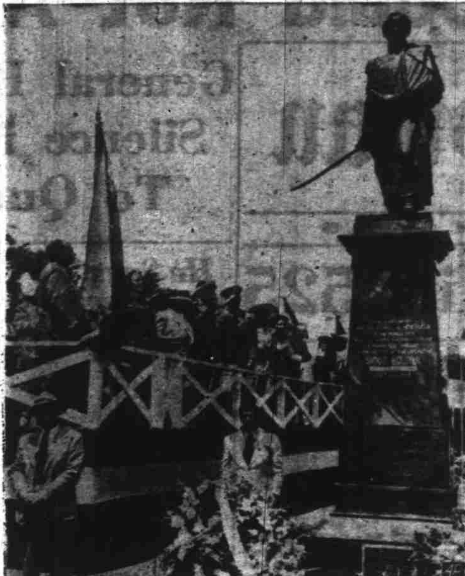
BOLIVAR, Mo., July 5 — President Romulo Gallegos of Venezuela (left of flag) looks up at statue of Simon Bolivar following the unveiling of the $100,000 gift to the city of Bolivar, Mo. President Truman accompanied President Gallegos from Washington for the unveiling.