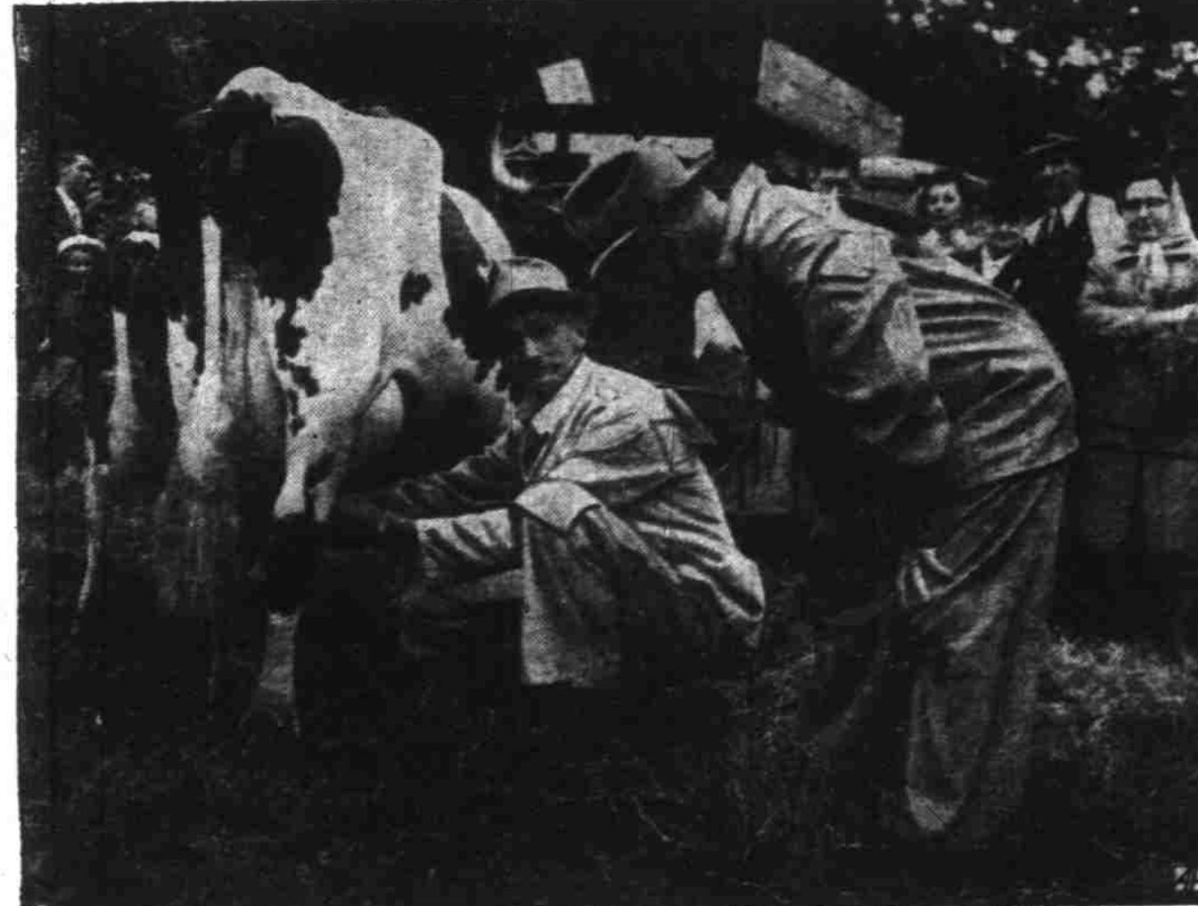
COW-MILKING CONTEST — State Senator Charles Olsen (right) of Massachusetts observes technique of State Rep. W. Arthur Simpson of Vermont during cow milking contest on Boston Common between legislators of the two states. The Massachusetts men won.