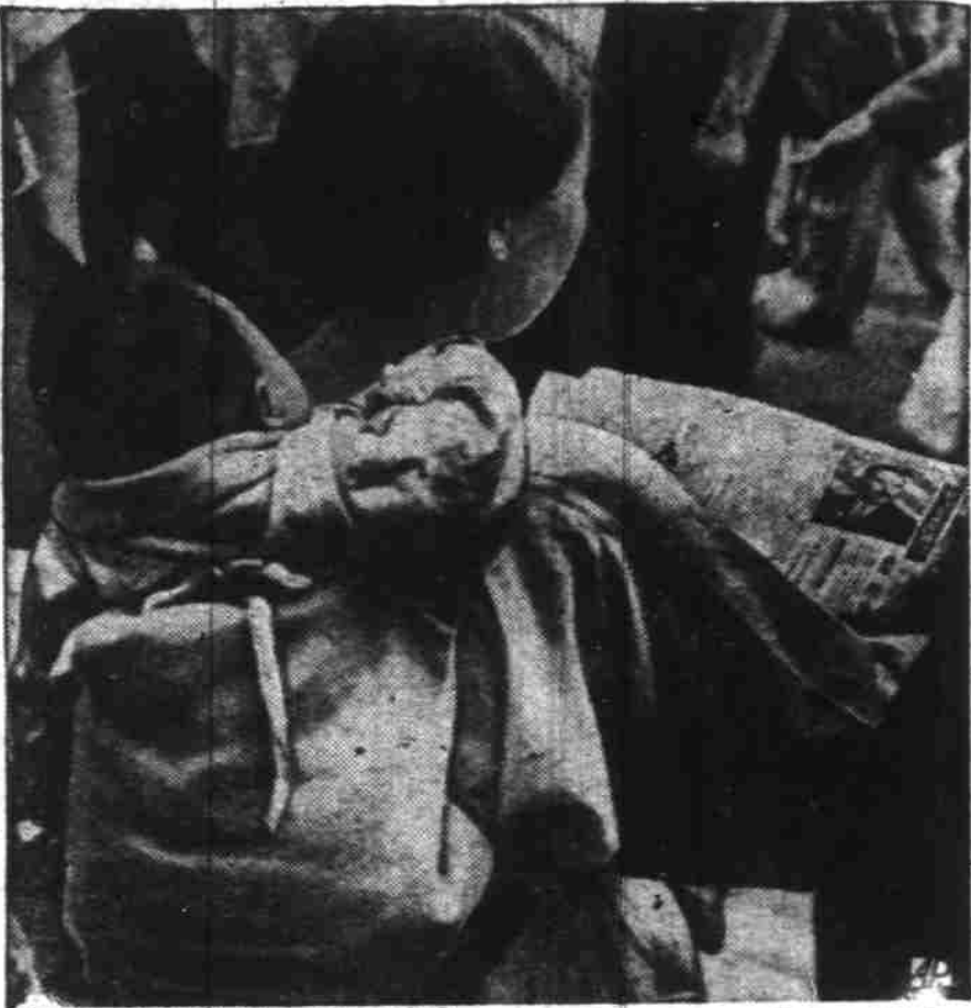
POLITICAL NEWS — A Japanese mother, child strapped to her back, news in Tokyo about the selection of New York's Gov. Thomas E. Dewey as Republican presidential nominee.