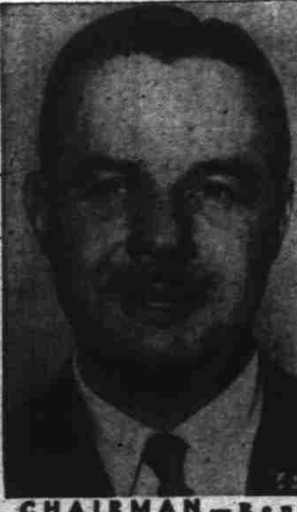
CHAIRMAN — Rep. Hugh D. Scott, Jr., of Penna., is the new chairman of the Republican National Committee.