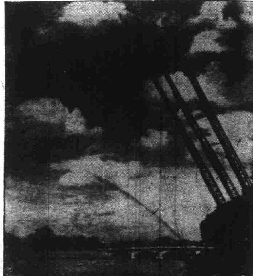
FIRE DRILL — High above Seine River at Paris, firemen show how they help guard the French capital.