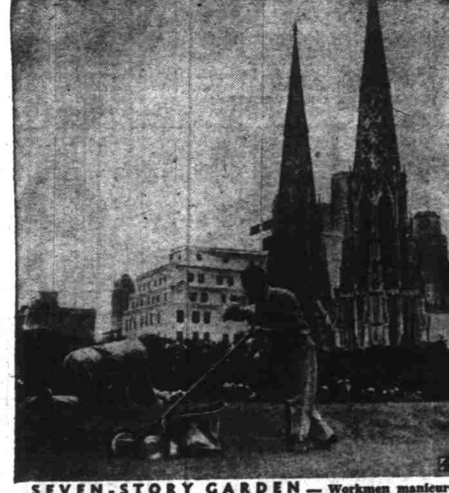
SEVEN-STORY GARDEN — Workmen manure a lawn and garden on seventh floor of La Maison Francaise, one of the fifteen buildings of New York's Rockefeller Center. The spires of St. Patrick's Cathedral are in background.