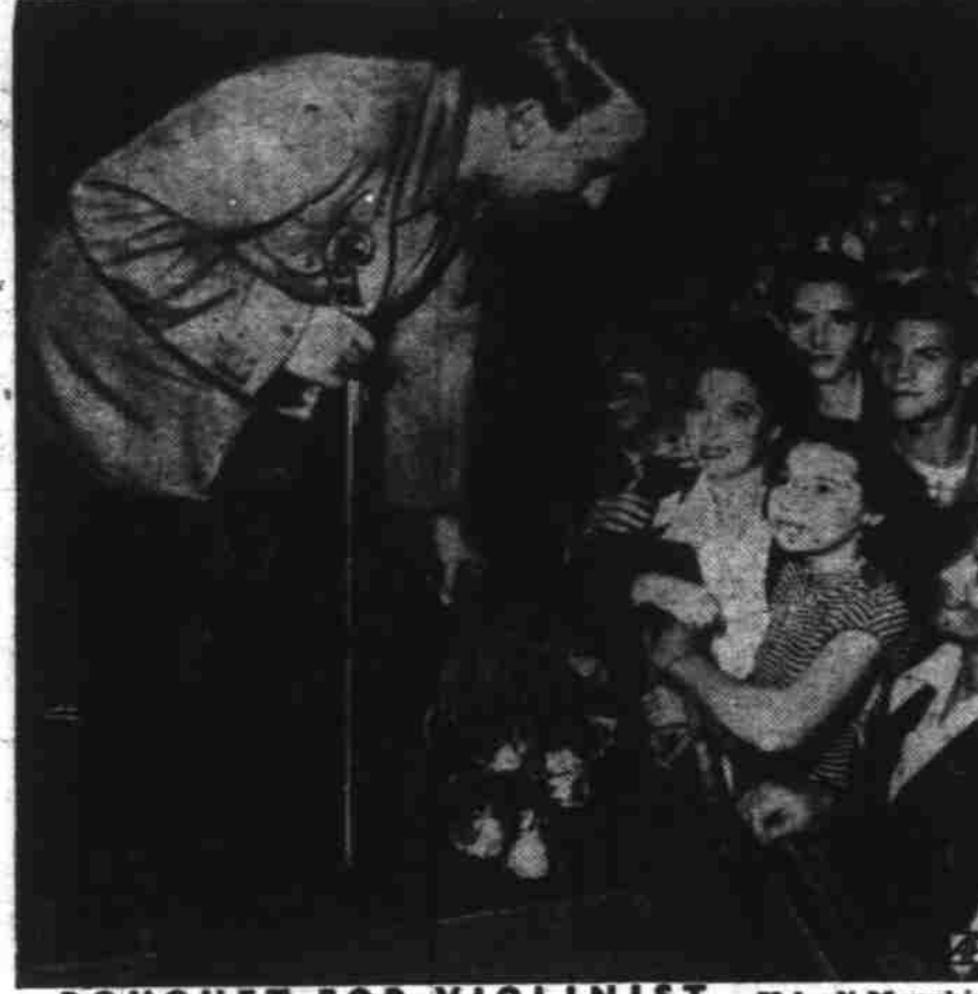
BOUQUET FOR VIOLINIST — Yehudi Menuhin receives flowers and thanks from Jewish displaced persons and students of the Vienna Music Academy after the noted violinist gave a recital at Vienna.