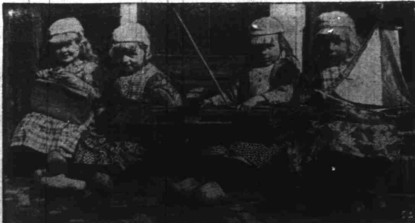
TOTS DRESSED ALIKE — Children in Holland are dressed alike—except for caps—until they are 6 years old. Boys' caps are of 6 pieces of cloth; girls' of 3 pieces. Child on left of these four at Markon, Holland, is girl. The others are boys.