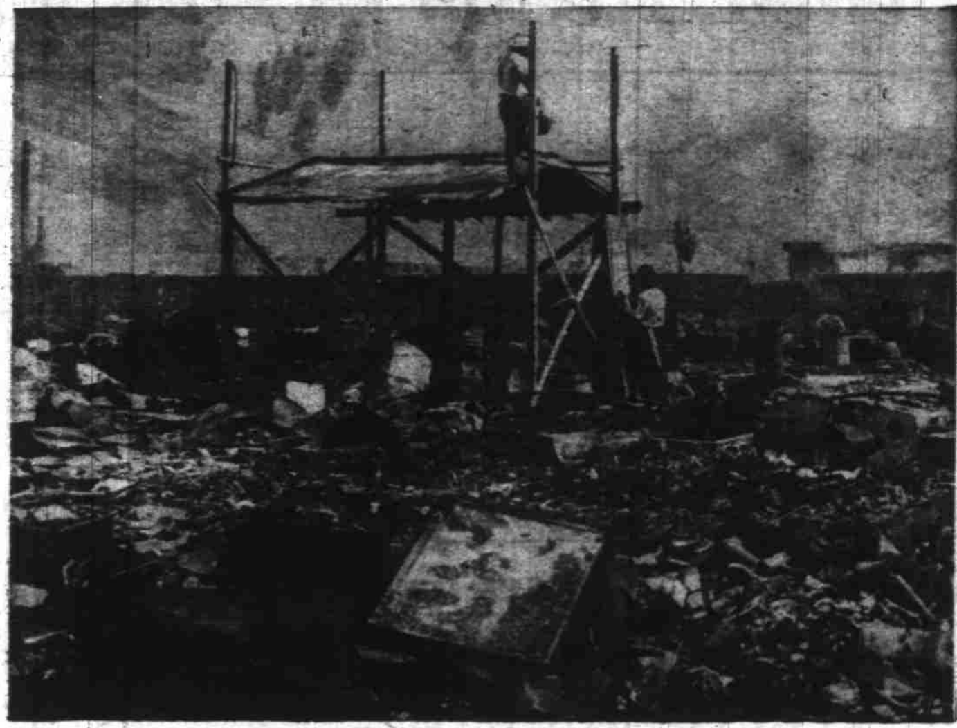
FUKUI, Japan, July 2—Residents of Fukui, Japan, build a temporary structure amidst wreckage within hours after a disastrous earthquake and fire swept the industrial town.