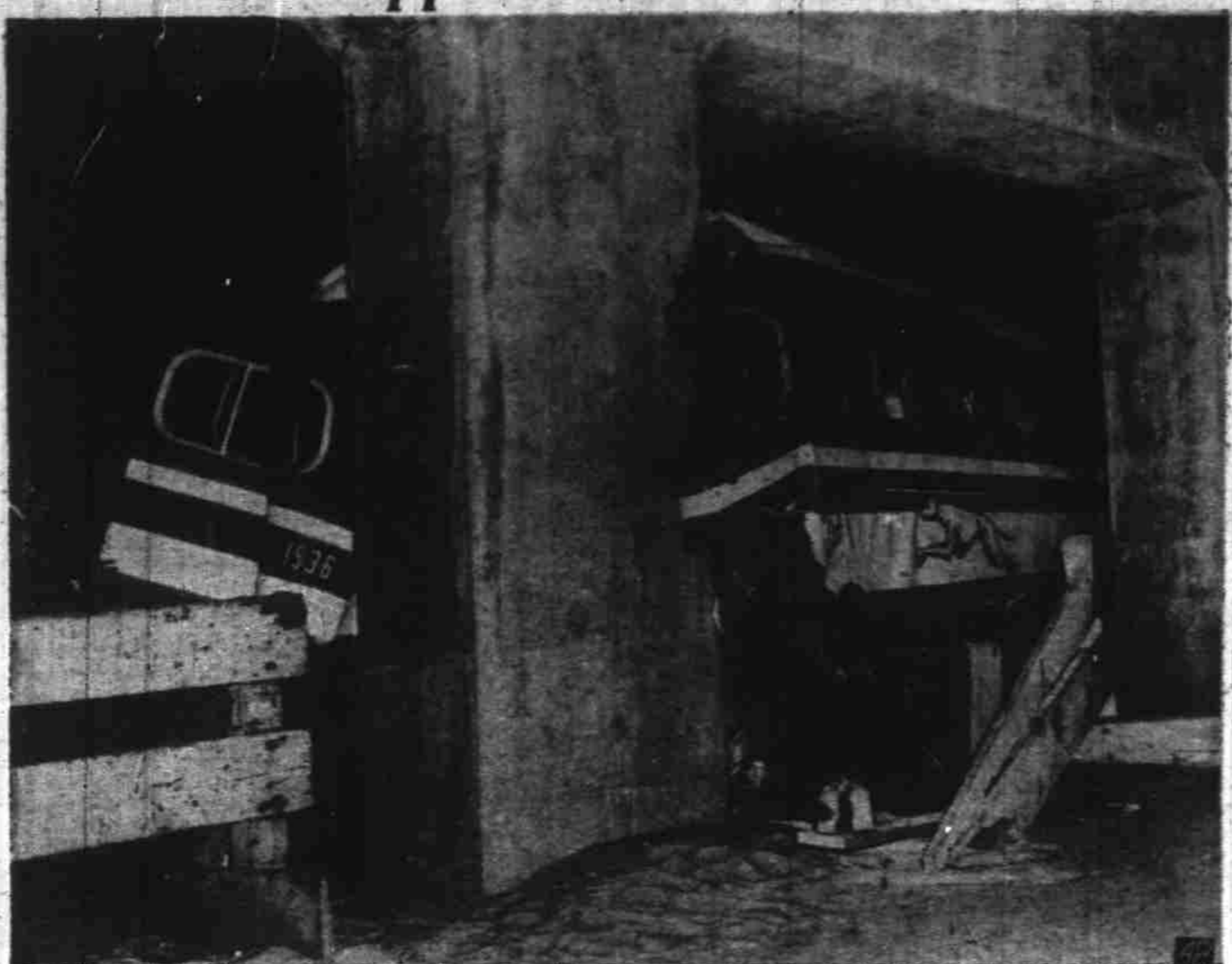
SAN FRANCISCO, July 1—An unidentified passenger sits seriously injured and trapped in a big bus after it had been involved in a collision with an automobile near San Francisco which sent it swerving into a cement pillar. Twenty-four other persons were injured.

ICE CREAM Quarts 33c SAVING CENTER Salem & West Salem