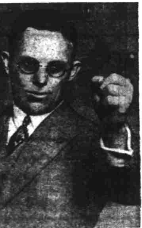
THE FUTURE GOVERNOR graduated from U. C. law school and was elected Alameda county district attorney three times.