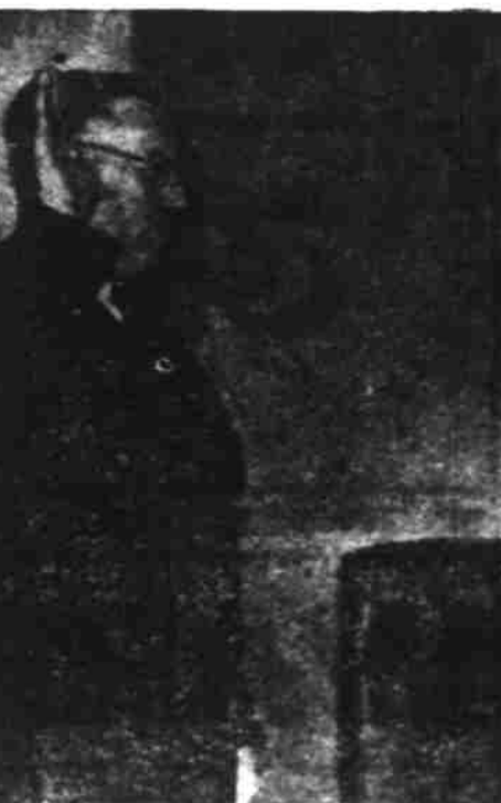
SWORN IN (above) as state attorney general, he extended his interest in better police work. That year (1938) his interest gained a personal drive. His father was bludgeoned to death and the crime never has been solved.