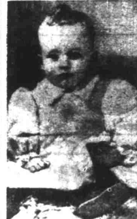
EARL WARREN was born in Los Angeles in 1891, his father Norway-born, his mother of Swedish parentage.