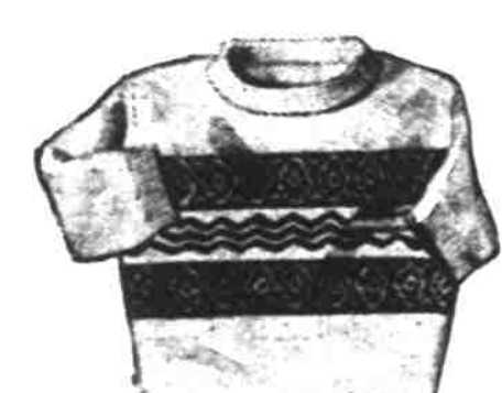
Tell Pop he's a great guy with either a sport short or a T-shirt. Something he'll appreciate for casual wear after work and on his vacation. We do have an outstanding selection of the most desirable lines on the market.