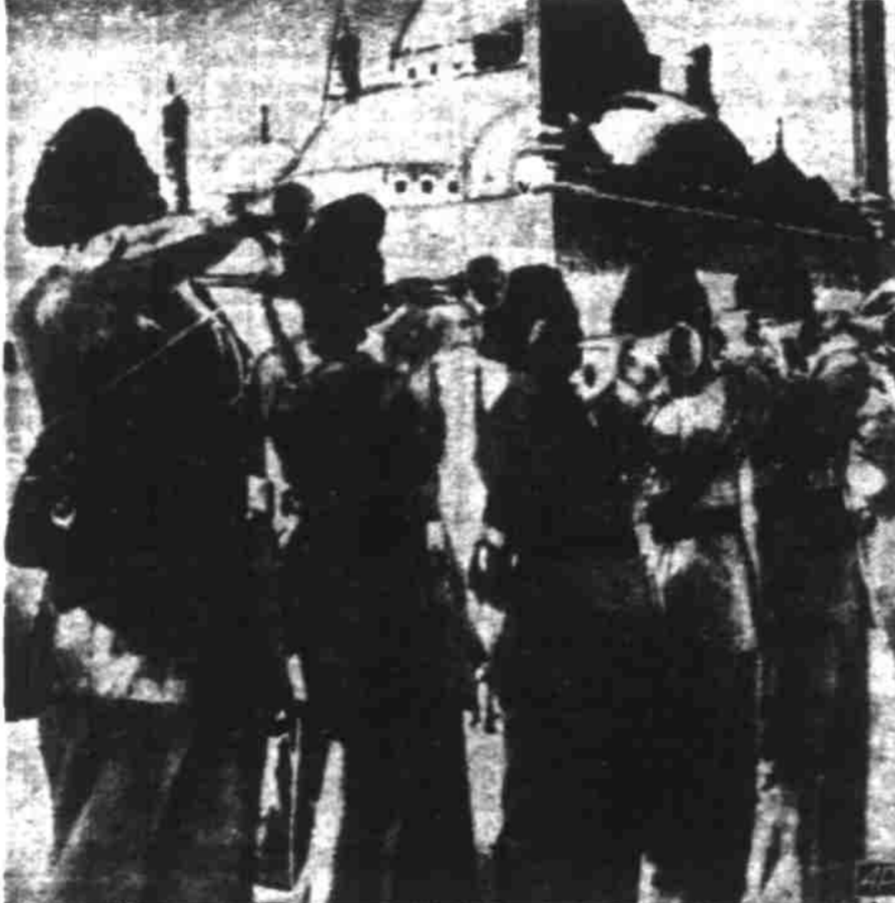
CAIRO, Egypt, June 11 — Egyptian army buglers sound the "cease fire" from Cairo's historic citadel following the acceptance of four-weeks truce in Arab-Jewish fighting. In background is the Citadel Mosque, built by Mohamed Ali, founder of modern Egypt. (Story on page 1.)