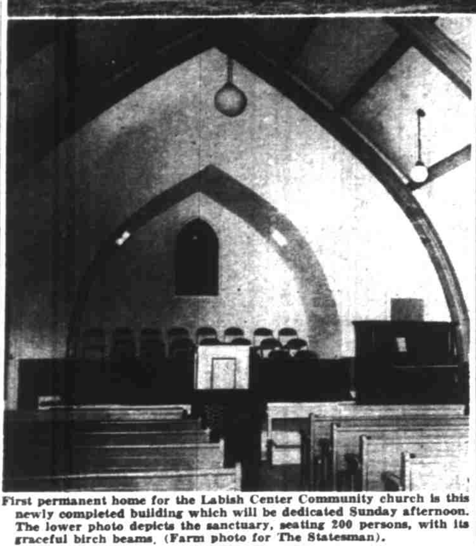
First permanent home for the Labish Center Community church is this newly completed building which will be dedicated Sunday afternoon. The lower photo depicts the sanctuary, seating 200 persons, with its graceful birch beams.