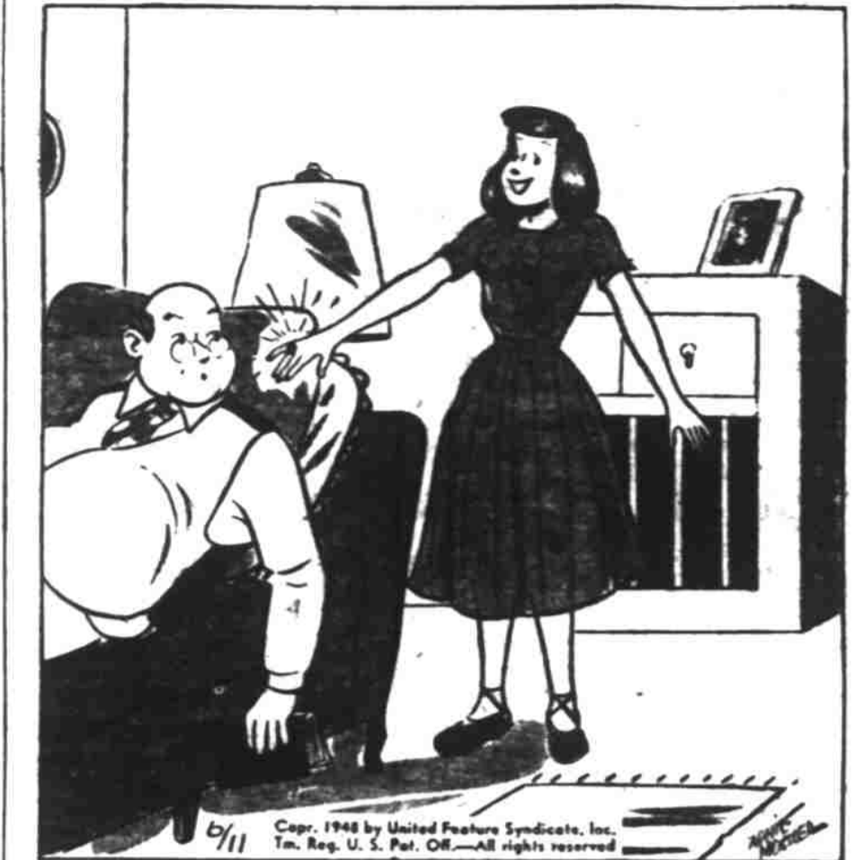
"Well, Pop, starting in June, 1958, I'll no longer be a burden on your bank roll!"