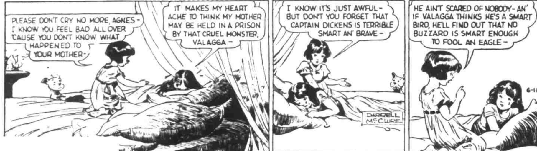
LITTLE ANNIE ROONEY