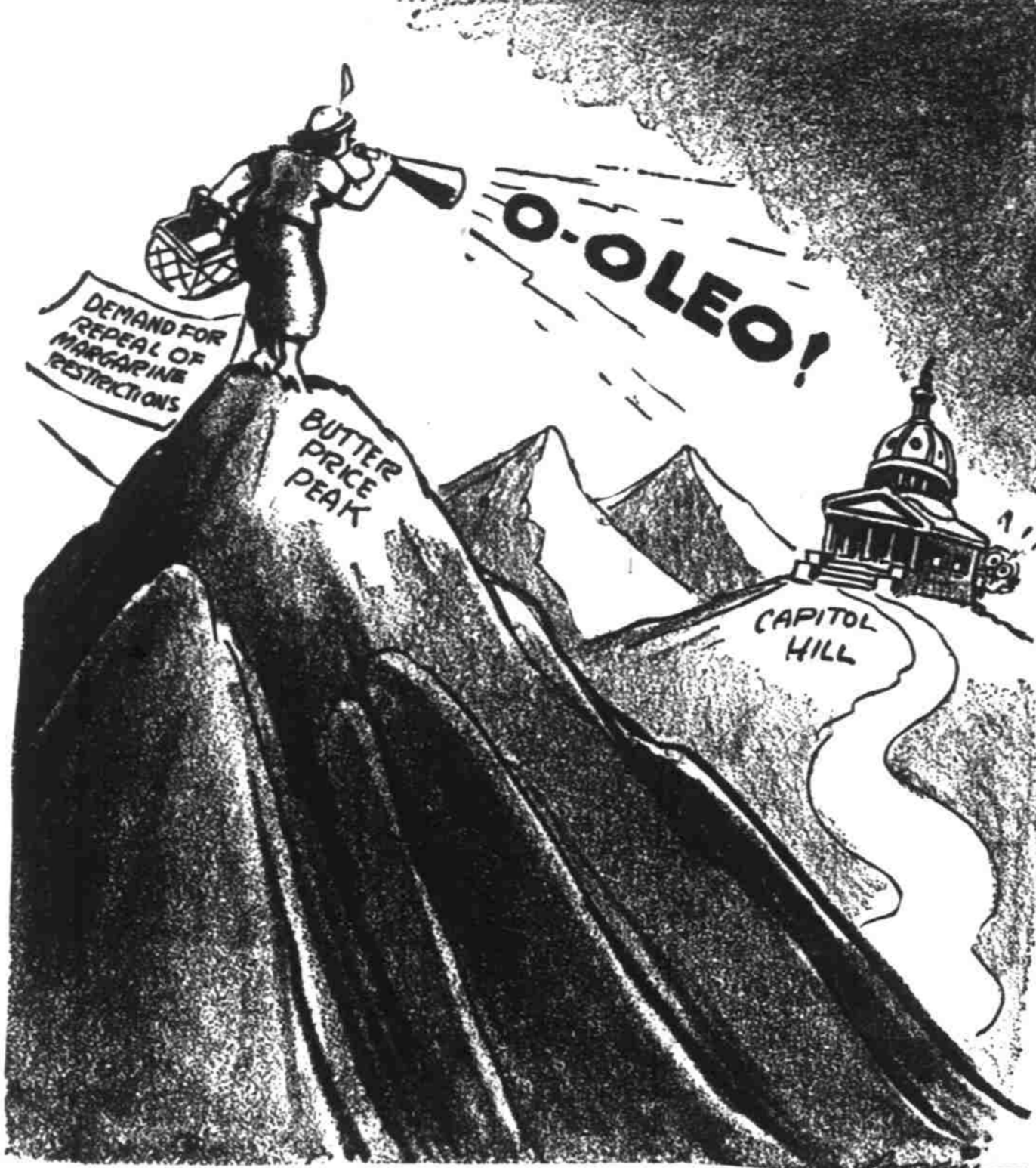
"Alps of America"