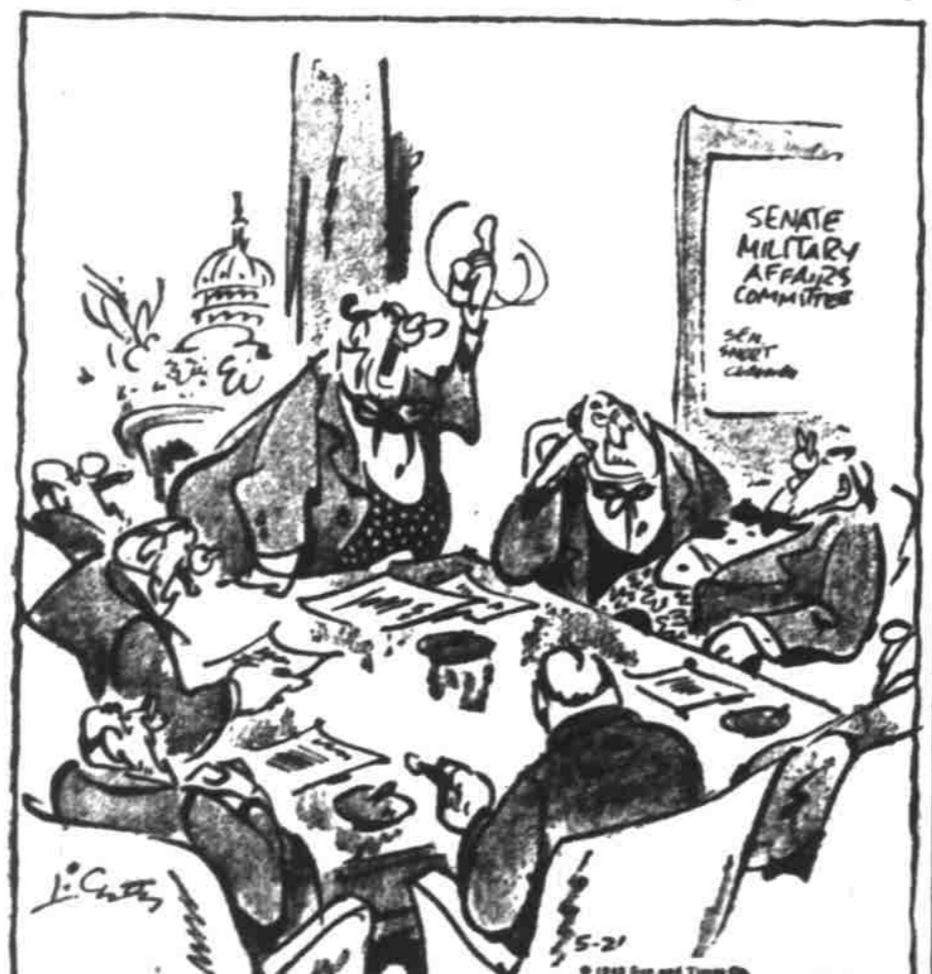
—And if the safest place in an Atomic War will be at the front—I propose that flat feet and spectacles exempt a man from civilian life!