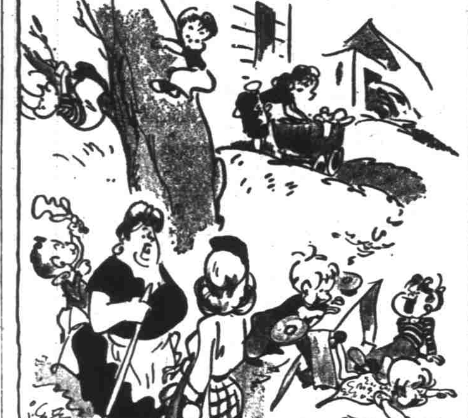
"Poor thing!-She's all worn out caring for that childit's her first one!

Of interest to the industrial west is the reduction of prices on steel and steel products for the Geneva, Utah, plant of U. S. Steel. Base prices at Geneva are now identical with those for in the se similar products at U. S. Steel's subsidiaries in Pittsburgh, Chicago, Gary and Birmingham. Previously the differential at Geneva was $3 a ton above other points. There remains the substantial freight charge from Geneva to west coast points, but finally we have a western mill selling on a parity with mills in the east and south. This will be a factor in west coast develop-