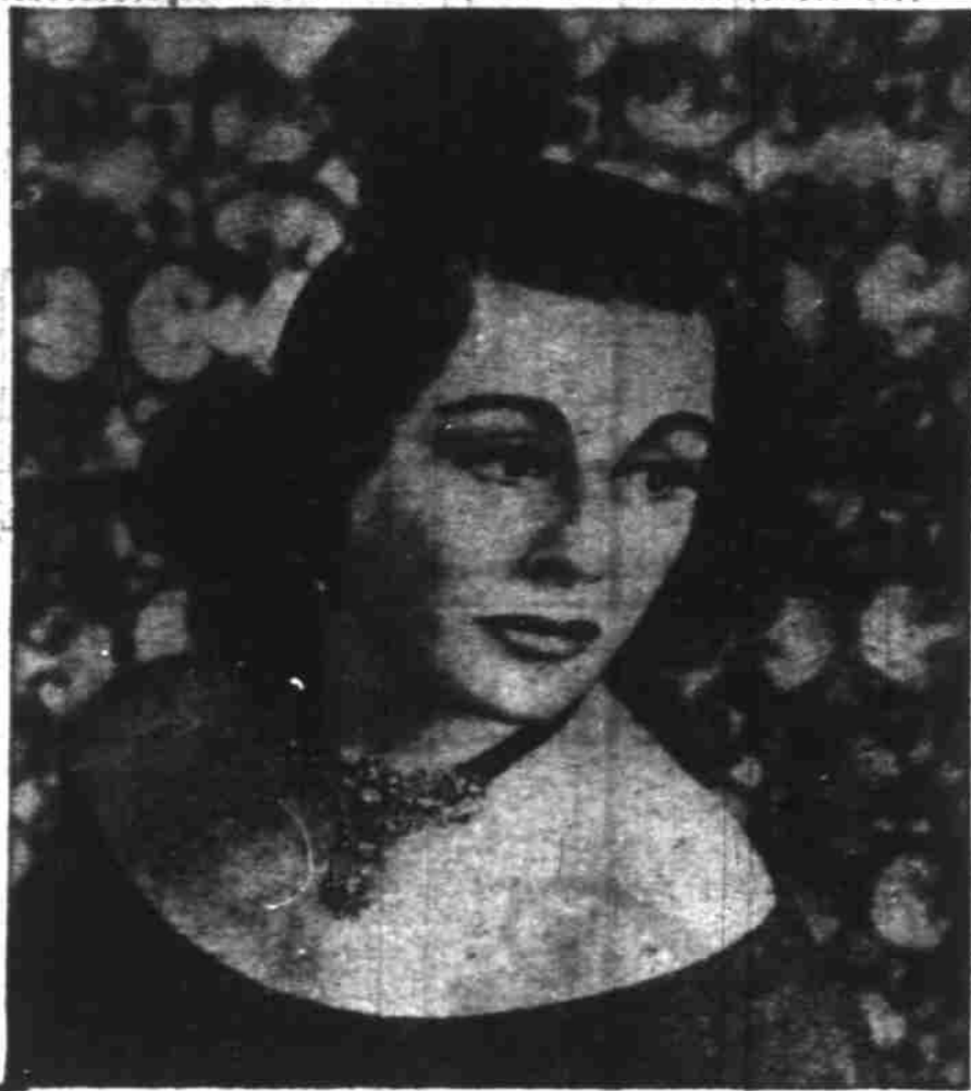
Gladys Swarthout, mezzo-soprano, who is to sing in Salem at the high school auditorium Monday, as the final artist in the Salem Community Concert association series for the year.