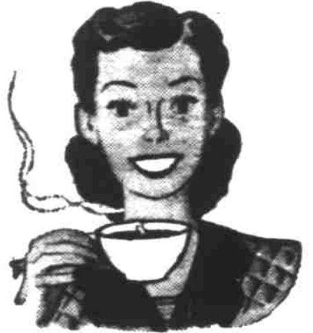
The blend is so mellow