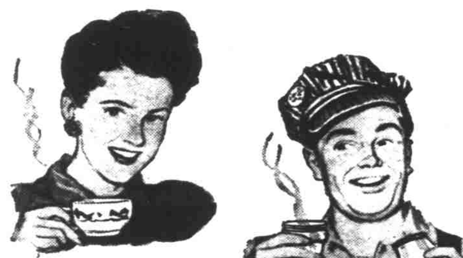
The girls praise my coffee