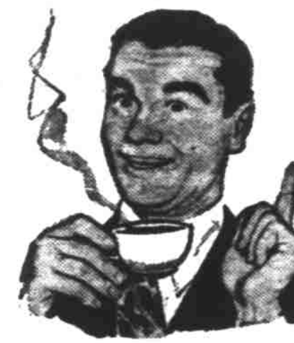
We men think it's swell!