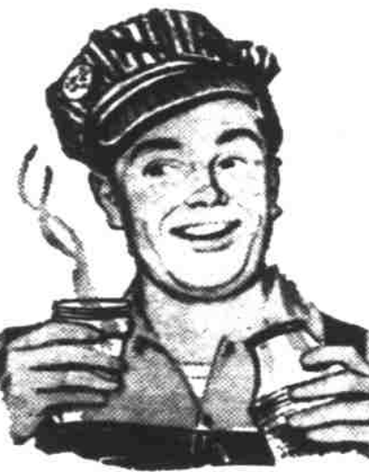
It sure rings the bell