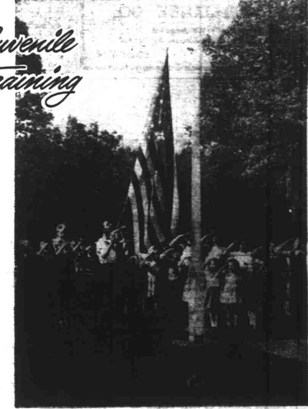
Summer camps provide practical training in moral responsibility and good citizenship.

Be a Minuteman! $18 Maintains this chain of Mercy around the world for one Full Minute!