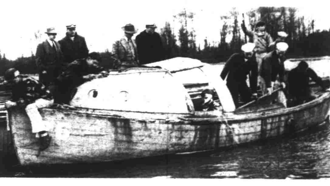
Members of Salem's Sea Scout ship 12 are shown working on their recently arrived whaleboat, a gift of the U. S. navy from surplus stores.