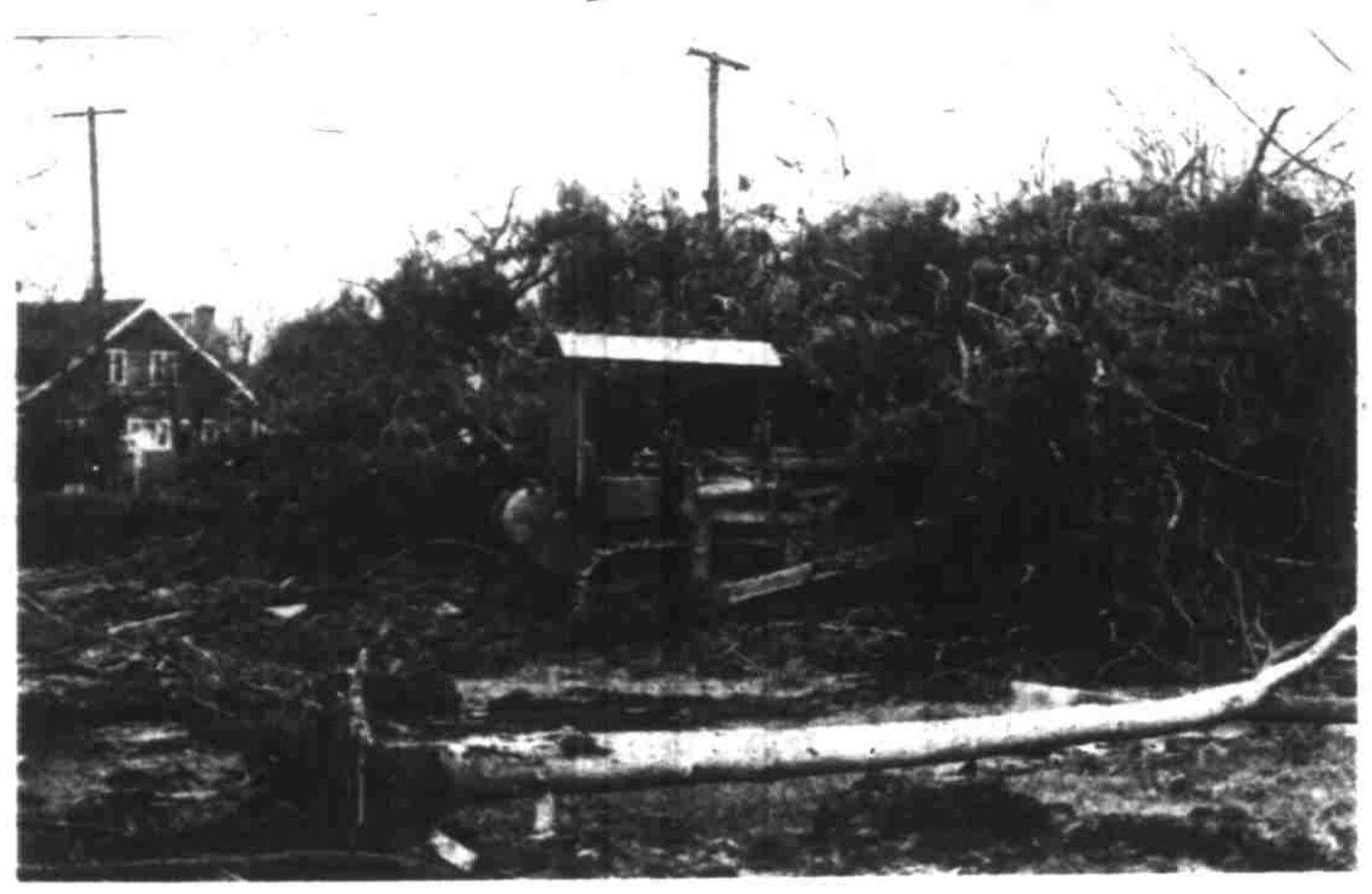
Work toward construction of a $2,000,000 two-block retail shopping center, with a new Sears Roebuck building site along the east side of North Capital and other stores, was underway Thursday at this street, between Center and Union streets. Trees, shrubbery and foundations of removed houses of the former residential area are being cleared by crews working for Hoffman Construction Co. of Portland, contractor for the Pacific Mutual Life Insurance Co. of Los Angeles. Shown above (looking across Capital at the Center street corner), showing a huge cedar tree out of the way after pulling it over is Charles Leslie, 940 Plymouth st., bulldozer operator for the Ben Ojten excavating company of Salem, sub-contractors to Hoffman.