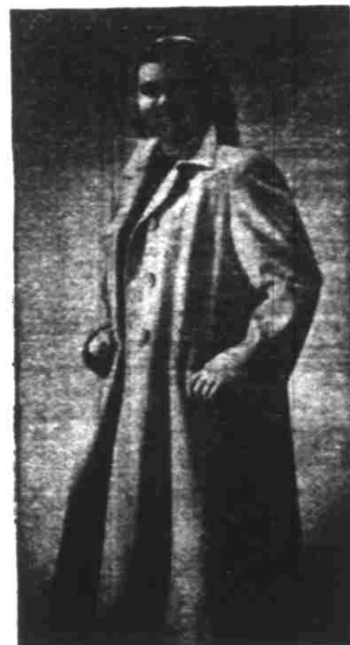
STYLE NO. 608