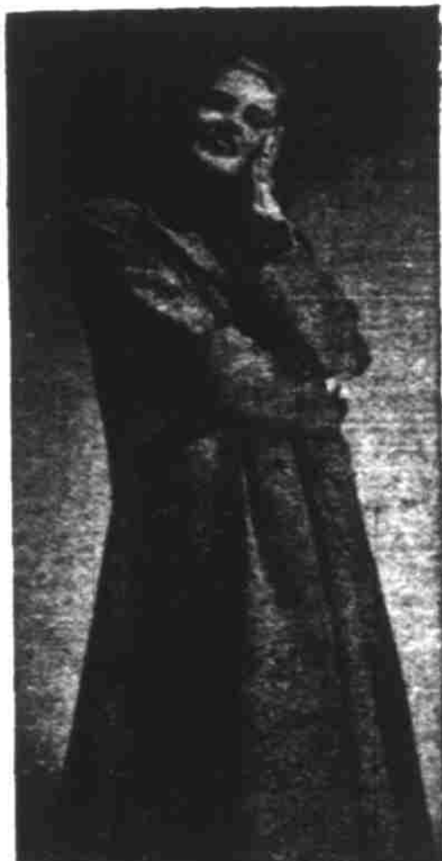
STYLE NO. 608

525 So. Winter St., Salem Telephone 6513