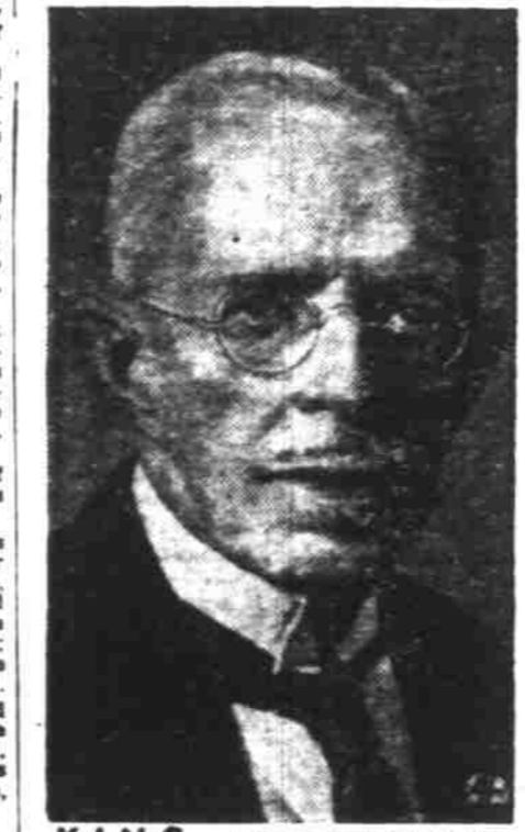
KING—King Gustaf V, 89-year-old monarch of Sweden, posed for this picture recently in Stockholm.