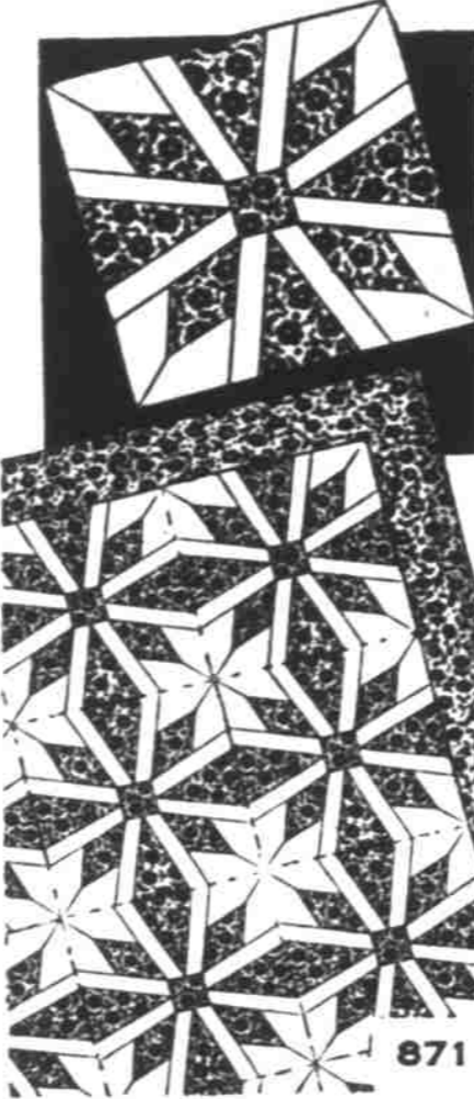
871 Laura Wheeler

Have you got that quilting bee in your bonnet? Here's the very design? The Poinsettia—just picture it in red and white, solid or print. Here's a happy task for your quilting hobby! Pattern 871 has pattern pieces; complete directions. Laura Wheeler's new, improved pattern makes needlework so simple with its charts, photos, concise directions. Send TWENTY CENTS in coins for this pattern to The Oregon Statesman, Laura Wheeler, 1st and Stevenson Sts., San Francisco, Calif. Print plainly PATTERN NUMBER, your NAME, ADDRESS with ZONE. Your NEW 1948 Laura Wheeler Needlecraft Book is ready! Send FIFTEEN CENTS and get the best needlecraft catalog ever published. 101 illustrations of the finest in embroidery, crochet, knitting, home decoration, toys, accessories. Printed in this book are FREE instructions for weaving on huck toweling—the newest hobby!