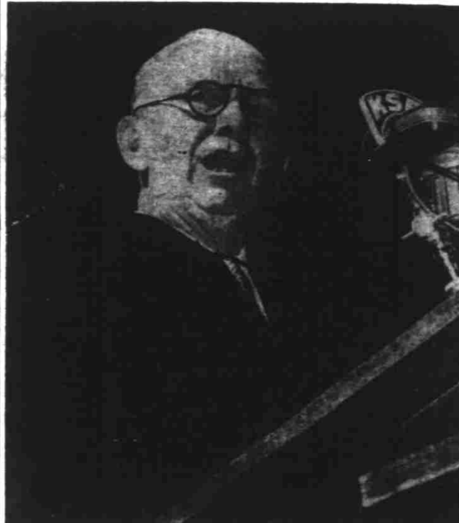
BERKELEY, Calif., March 20 — Secretary of State Marshall, speaking at charter day ceremonies at the University of California, Berkeley, warns that the communist encroachment upon free peoples can no longer go unchecked. He cautioned Italy and other free European nations that election of a communist government automatically cuts them off from American recovery aid.