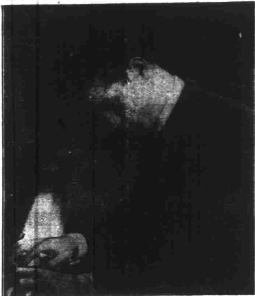
William Kapell, "electrifying" young pianist who appears Wednesday night at the Salem high school on the Community Concert series. The program is to be given for members of the association.