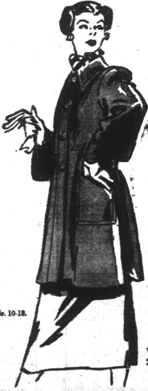
Wool suede. 10-18. 24.75

Elegance of fabric... flawless fit... The Easter story beautifully told