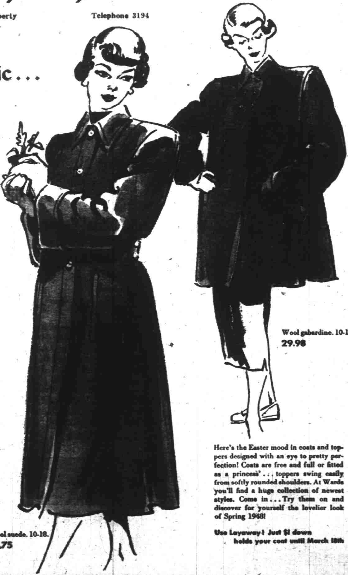
Wool gabardine. 10-18. 29.98