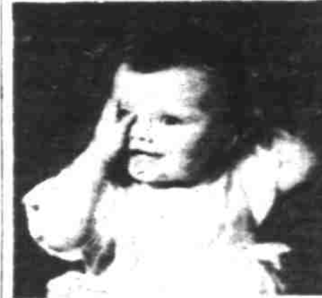
Prize Baby in Photogenic Contest