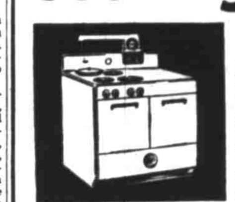
Frigidaire's Famous Model R160

It is Hogg Bros. sincere desire to be of the utmost help to every housewife in the care and use of all major electrical appliances. With this thought in mind, Hogg Bros. are still conducting their weekly cooking school, held on the Mezzanine Floor each Thursday, starting at 2:30 p. m.