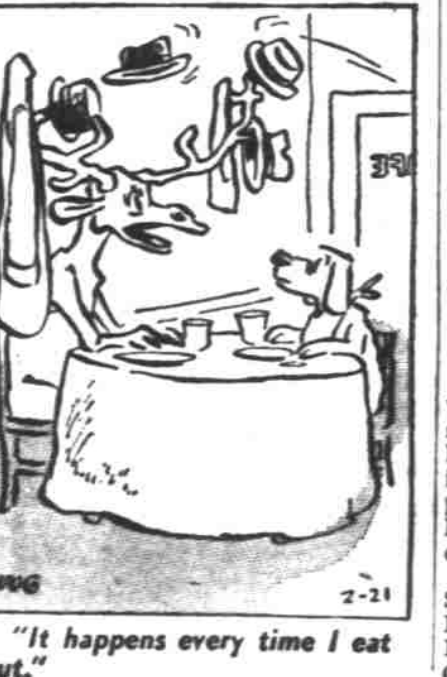
"It happens every time I eat out."

The opening engagement in the intra-party battle is set for Monday when 16 representatives of the south—five governors and 11 congressmen—will lay their angry protest before national party chairman Howard McGrath. Organization of the congressional group was in answer to a plea of support from the southern governors' conference February 8. At that time the governors served a 40-day ultimatum on the national party headquarters to abandon the proposals.