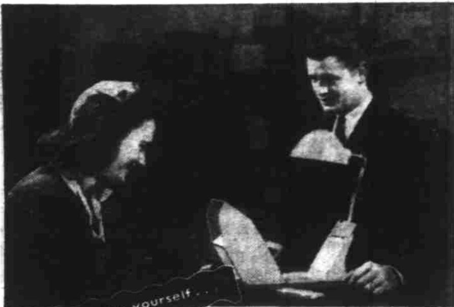
See for yourself...