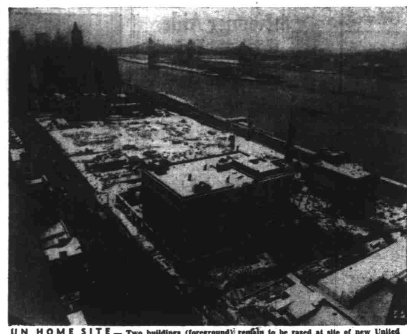
UN HOME SITE - Two buildings (foreground) remain to be razed at site of new United Nations home on New York's East River. Scene is looking north from 42nd St. on 1st Ave.

Complete Concrete & Rock Drilling Service Phone, Office 9038 1042 S. Commercial St. At the Pit, 2-2160