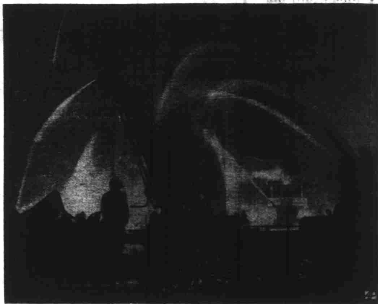
FIRE FIGHTING AT NIGHT —Water from extension towers pours in looping arcs into a pier burning at night at Brooklyn, N. Y. Damage was estimated at $1,500,000.