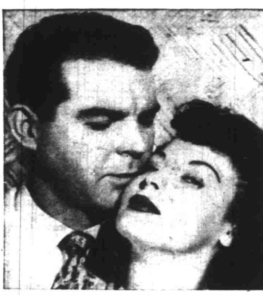
Fred MacMurray and Ava Gardner play the romantic leads in the exciting Universal-International melodrama, "Singapore," at the Grand today.