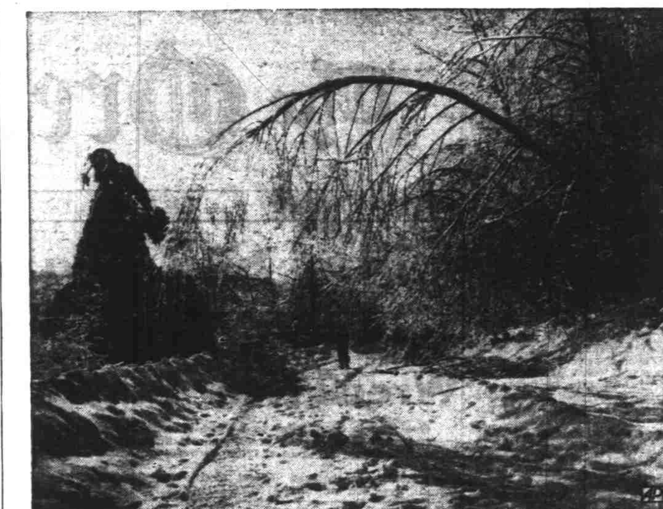
TREES BOW UNDER ICE—Ice-covered trees bend over a road at Budd Lake, N. J. The tree at the left is a large blue spruce, its top twisted into an odd shape.