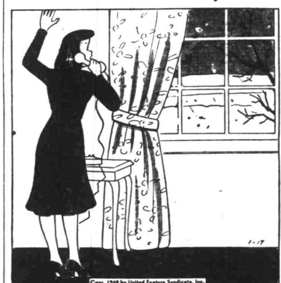
Pop says I can go out with you tonight, Buford, if you'll come and shovel me out!

NEW YORK, Jan. 16 (AP)—Aided by rails, the stock market's overall average managed to shift into the plus column today after six straight generally losing sessions although numerous leaders were unresponsive.