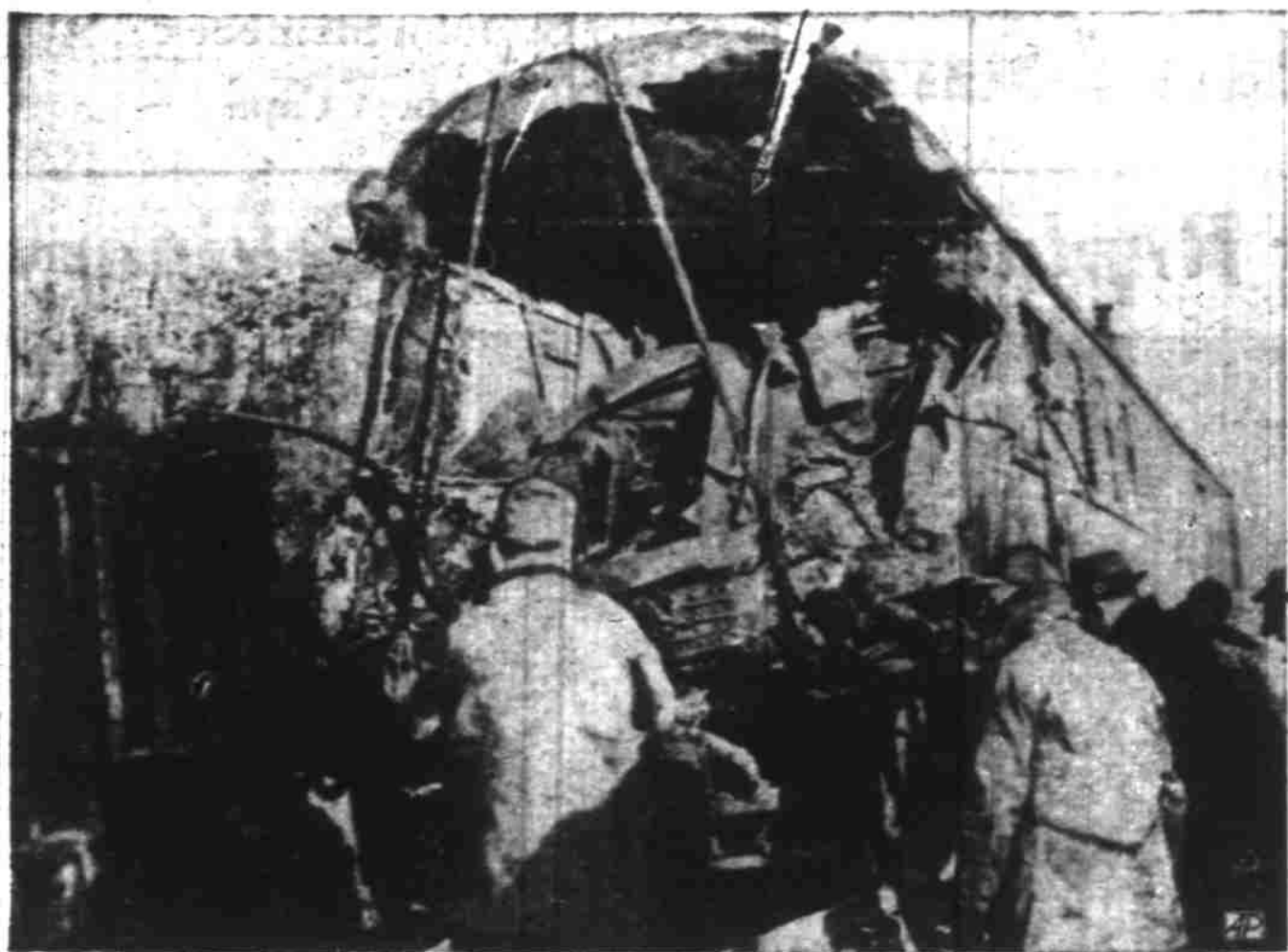
LITTLE ROCK, Ark., Jan. 16 — Workmen replace a Rock Island passenger coach on tracks after it had been telescoped in an early morning train wreck near Little Rock, Ark. One passenger was killed and several other passengers hurt. The passenger train engineer was also killed.