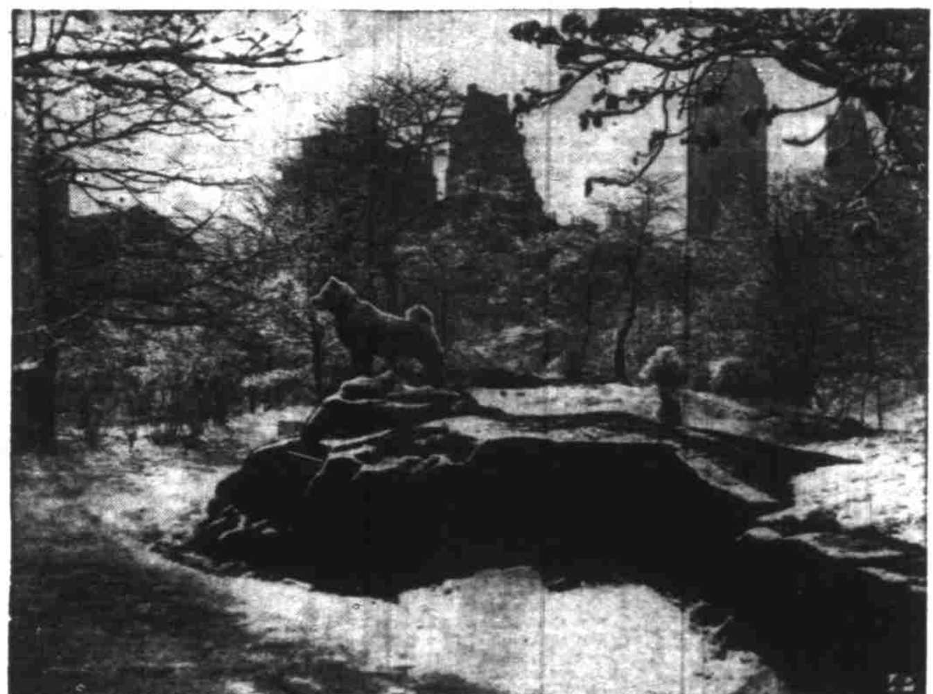
SNOWY PARK SCENE — A statue to Balto and other heroic sled dogs who carried serum to Nome, Alaska, through an Arctic blizzard is mantled with snow in Central Park, New York.