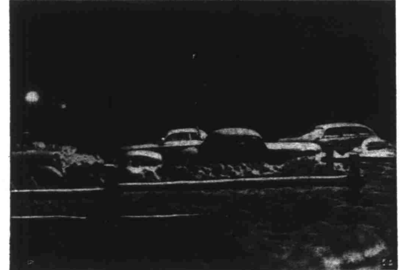
NEW YORK WINTER —Manhattan streets were cleared a few days after the record New York snow of 1947, but this was the scene in outlying Queens two weeks later.