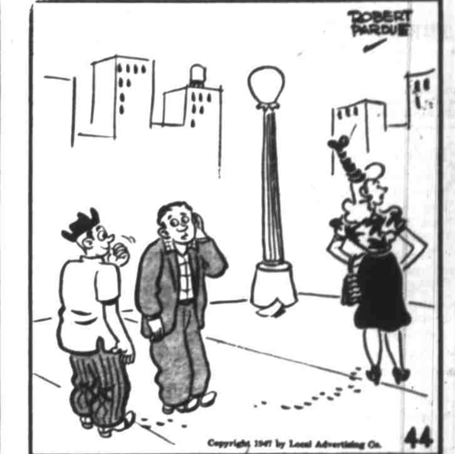
"I'll admit she hasn't much taste in hats, but she always buys GREEN VALLEY ICE CREAM."