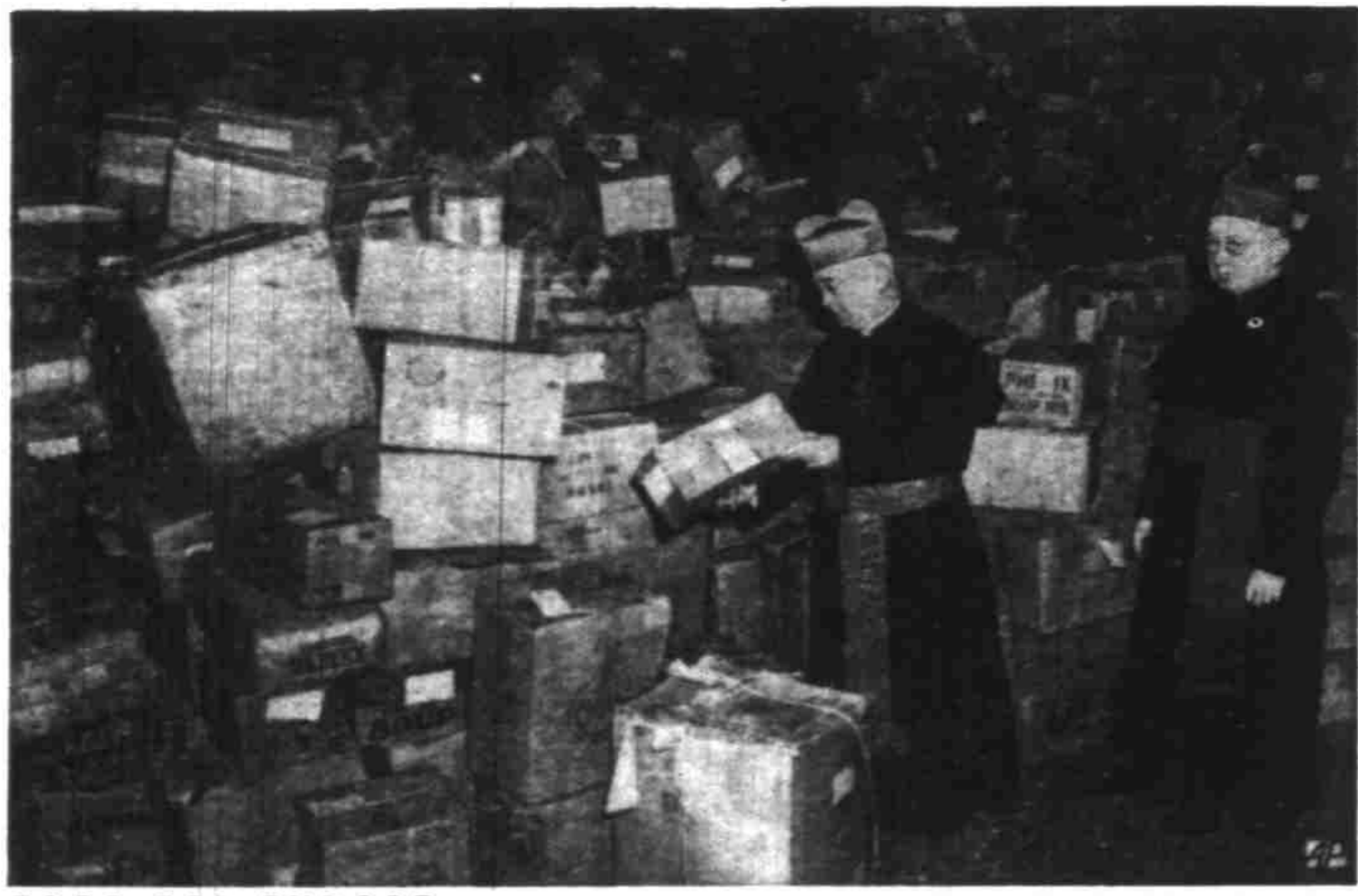
FOOD FOR EUROPE —Francis Cardinal Spellman and Archbishop-elect Patrick A. O'Boyle look over some of the food contributed in a National Catholic Welfare drive for European relief.